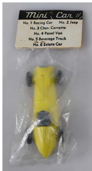
58. BRENTWARE MINI No 1 RACING CAR 100mm long model, 175mm with original packaging, yellow Mazac alloy, Brentware, No. 1 Racing Car, marketed as Mini Cars by Lincoln, minor paint loss, Very Good 9/10