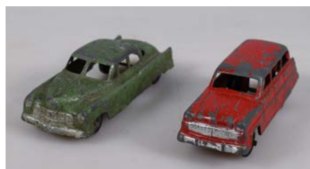
136. BRENTWARE MODEL CADILLAC SEDAN, FORD ESTATE CAR VEHICLES 116mm long, green Mazac alloy, Brentware Cadillac Sedan paint loss, Good 6.5/10 plus 100mm long, red Mazac alloy, Brentware, Ford? Estate, paint loss, Good 6.5/10 (2)