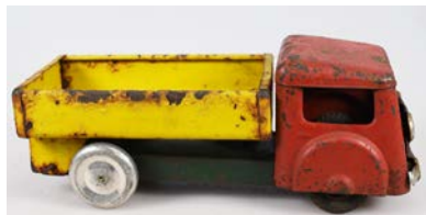
200. LINCOLN SUPER HERCULES NZ TOY TIP TRUCK 285mm long, red/yellow pressed steel, Lincoln Super Hercules Tip Truck, rear wheel have been replaced, front wheels are rubber indicating Lincoln manufacturer, rust, paint loss/wear Good 6/10