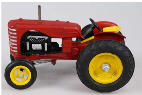
99. LINCOLN MAJOR MODEL MASSEY HARRIS TRACTOR 150mm long, red/yellow Mazac alloy, Lincoln Major Model Massey Harris Tractor, No. 4101, bonnet inscribed Empire Made, that is made in Hong Kong for Lincoln, c1950's, steering mechanism working, missing air cleaner & exhaust, very minor paint loss, 9/10