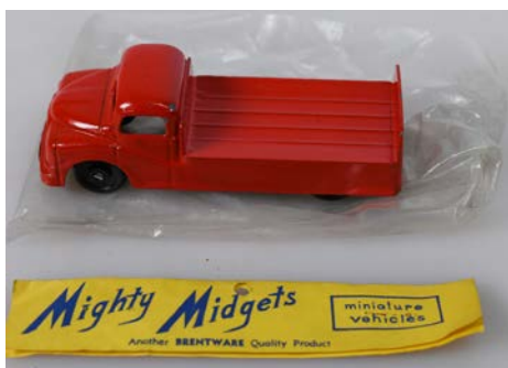
64. BRENTWARE MIGHTY MIDGETS DRINKS TRUCK 108mm long model with original packaging, red Mazac alloy, Brentware Mighty Midgets Drinks Truck, packaging has been opened but has not been played with minor paint loss, Very Good 9/10