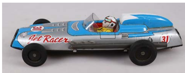
268. RACING CAR, MADE IN JAPAN 255mm long blue/grey pressed tin, No. 31, Jet Racer, Made In Japan on console, Dott G.R. to one side, (a Japanese Toy Maker), believed to have been marketed by Lincoln Toys light surface rust, paint loss/wear, Very Good 8/10