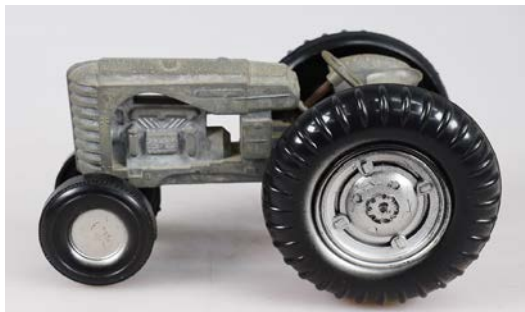
98. LINCOLN MAJOR MODEL MASSEY HARRIS TRACTOR 170mm long, unpainted Mazac alloy, Lincoln Major Model Massey Harris Tractor, No. 4101, c1950's, believed to be end of production with plastic wheels minor marks, Very Good 9/10