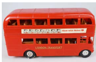
263. LINCOLN LONDON TRANSPORT DOUBLE DECKER BUS 300mm long, red plastic, Double Decker Bus, London transport to sides, 12 Piccadilly Circus, Junior Engineer on T.V. Lincoln Power Steering sticker to front, BOAC & Heinz advertising to sides, made in Hong Kong to base, friction drive is working, remains of stickers to wheels minor marks & wear, Very Good 8.5/10