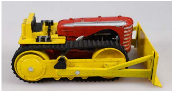
97. LINCOLN MAJOR MODEL CATERPILLAR TRACTOR WITH BLADE 165mm long, red/yellow Mazac alloy, Lincoln Major Model Caterpillar Tractor with blade, No. 4105?, bonnet inscribed Empire Made, that is made in Hong Kong for Lincoln, c1950's, missing exhaust stack, very minor paint loss, Very Good 9/10