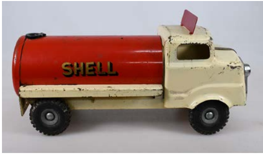
10. TRI-ANG JUNIOR SERIES SHELL TANKER 360mm long, red pressed steel Tri-ang Junior Series Shell Petrol Tanker, missing top cover latch and hoses minor rust, paint loss/wear, Good 7/10