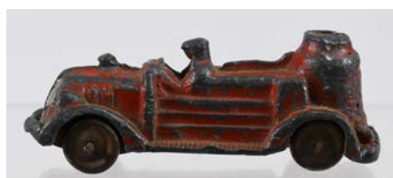
350L. TINK-E TOYS FIRE ENGINE 82mm long red lead, Tink-E Toys Fire Engine with tin wheels, marked Tink-E Toy paint loss/wear 7/10