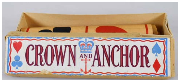
302. CROWN AND ANCHOR GAMBLING GAME 300mm x 70mm boxed game Crown & Anchor Crown And Anchor vintage gambling game, consists of 3 dice & playing mat, instructions to inside of box and marked Mere For Merriment, possibly a New Zealand company? play wear, some damage to box, Very Good 7.5/10