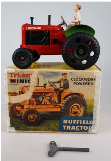
50. TRI-ANG BOXED MINIC SERIES 2 CLOCKWORK POWERED NUFFIELD TOY TRACTOR 225mm long box, 210mm long toy, red/green plastic body, metal mudguards & mechanism, Tri-ang Minic, Series 2, Clockwork Powered Nuffield Tractor, with driver, has key for wind up mechanism & steering (working) with reversing gear & hand brake, with box marked Lines Bro NZ Ltd, Tamaki Auckland, box made by Bakers Cardboard Box Co Auckland, has tape especially to one end, Good 7/10 Toy has minor marks, Very Good 9/10