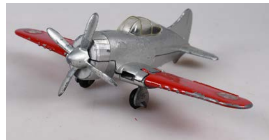
101. LINCOLN MAJOR MODEL NAVY WING FIGHTER 160mm long x 220mm wing span, red/silver Mazac alloy, Lincoln Major Model Navy Wing Fighter, model 4100, folding wings and wheels, ex Hubley U.S.A. dies, cast in New Zealand, minor paint loss, Very Good 8/10