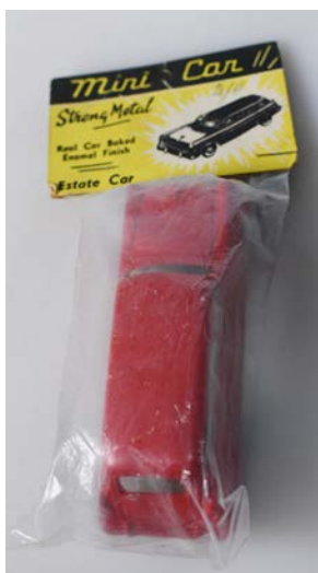
59. BRENTWARE MINI CAR No 1 ESTATE CAR 100mm long model, 160mm with original packaging, red Mazac alloy, Brentware, No. 1, 6 Estate Car, Racing Car, marketed as Mini Cars by Lincoln, Very Good 9.5/10