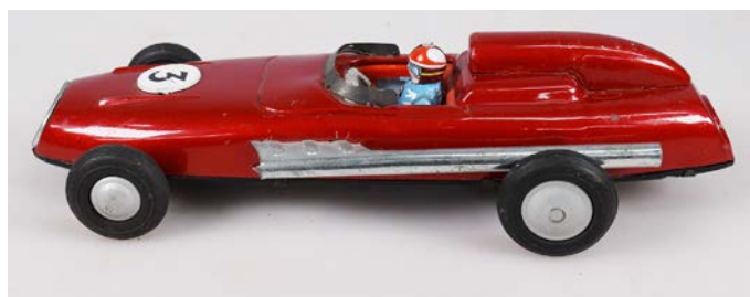
269. RACING CAR, MADE IN JAPAN 255mm long red/yellow pressed tin, No. 3, Racing Car, Made In Japan on console, believed to have been marketed by Lincoln Toys very minor surface rust, paint loss/wear, Very Good 8.5/10