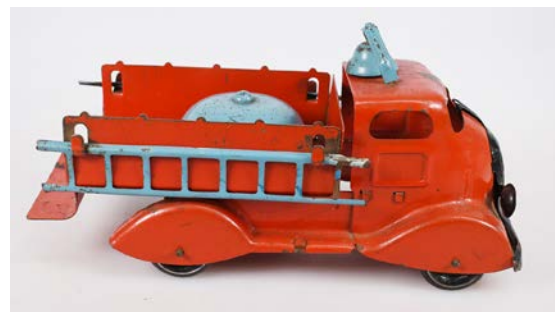
47. TRI-ANG W SERIES FIRE TRUCK 7686/W555 265mm long, red with blue accessories pressed steel, Triang W Series Fire Truck, working bell, Made in New Zealand sticker, black grill, steel wheels minor paint loss/wear, minor surface rust, Very Good 7.5/10