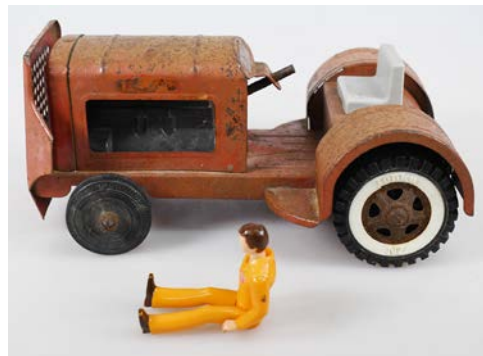
77. TONKA TRACTOR 220mm long, red pressed steel, Tonka Tractor, model 250, missing steering wheel, Tonka NZ rear wheels, surface rust, paint loss/wear Good 6.5/10 plus 95mm long orange plastic driver marked Tonka, Very Good, 9/10 (2)

270mm long, green pressed steel/plastic, Tonka No. 304 Jeep Commander GR2-2431 to sides of bonnet, Tonka to sides, impressed Jeep to front & sides, Made In New Zealand to base, in an American box surface rust, paint loss/wear, Good 7/10