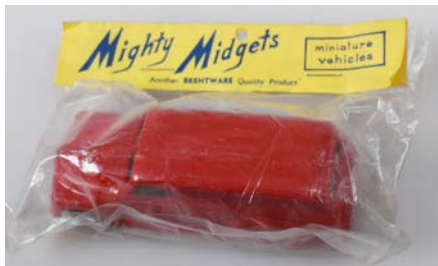
57. BRENTWARE MIGHTY MIDGETS PANEL VAN 103mm long model with original packaging, red Mazac alloy, Brentware Mighty Midgets Panel Van minor paint loss, Very Good 9/10