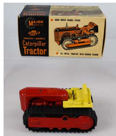
102. LINCOLN TOYS MAJOR MODELS CATERPILLAR TRACTOR 155mm long boxed toy truck, red/yellow pressed steel, Lincoln Toys, Major Models Massey Harris Caterpillar Tractor, Cat. No. 4104, Made In New Zealand By Lincoln Industries Ltd, Auckland, the box has the price 25/- marked on it, missing exhaust very minor paint loss, minor marks to box, Very Good 8.5/10