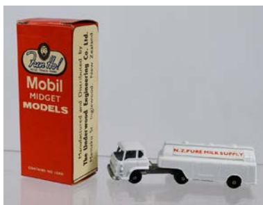
298. FUN HO MIDGET ARTICULATED MILK TANKER 40, BOXED 97mm long box, 95mm long car, white diecast, Fun Ho Midget Articulated Milk Tanker, No. 40 in original box, N.Z. Pure Milk Supply stickers to sides, early version, Mobil Oil advertising on box Excellent, 9.5/10