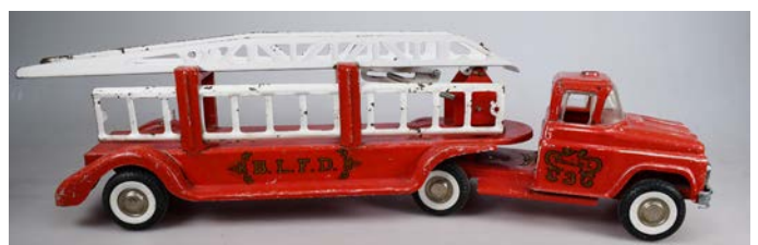
17. BUDDY L AERIAL LADDER FIRE ENGINE 640mm long, red/white pressed steel, Buddy L, model 40851, Aerial Ladder Fire Engine, B.L.F.D to sides, Buddy L 3 to cab doors, missing red flashing light to cab roof & one side ladder, existing side ladder slightly bent, ladder elevating mechanism not working, minor surface rust/ paint loss, Good 6.5/10