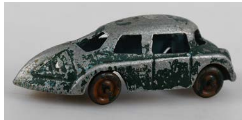
300. FUN HO RACING SMALL ULTRA SALOON 169 100mm long, green Fun Ho model 169, Small Ultra Saloon repainted green over blue, paint loss/wear, Good 7/10