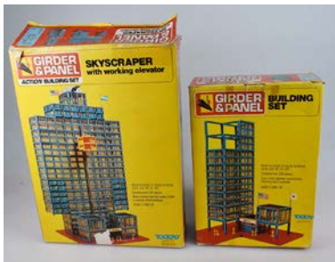
297. TOLTOYS SKYSCRAPER SET & BUILDING SET 270mm x 355mm boxed plastic, Girder & Panel Action Building Set, Skyscraper with Working Elevator, Made in New Zealand By Toltoys Auckland Under Licence From Kenner Products, USA with instruction sheet, unknown if it is totally complete, tape & storage wear to box, Very Good 7.5/10 plus 200mm x 290mm Girder & Panel Action Building Set, Made in New Zealand By Toltoys Auckland Under Licence From Kenner Products, USA unknown if it is totally complete, tape & storage wear to box, Very Good 7.5/10 (2)