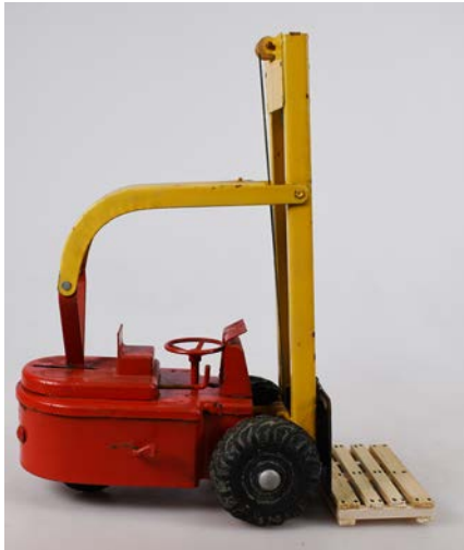
56. TRI-ANG FORKLIFT NUMBER 40799 255mm long, 285mm tall, yellow/red pressed steel, Tri-ang Forklift, model 40799, with home made pallet and forks, Tri-ang Made In New Zealand sticker to cab roof, in working order light surface rust, paint loss/wear, Good 7.5/10