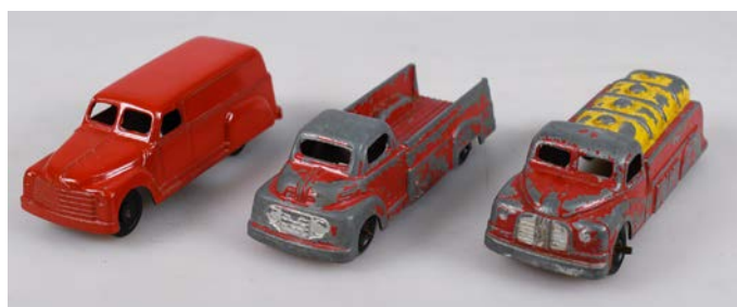
139. BRENTWARE MODEL CHEV PANEL VAN, FORD PICKUP, AUSTIN TANKER 102mm long, red Mazac alloy, Brentware, Chev Panel Van minor paint loss, Very Good 9/10 plus 110mm long, red Mazac alloy, Brentware, Ford? Pick Up Truck paint loss, Good 6.5/10 plus 110mm long, red/yellow Mazac alloy, Brentware, Austin Petrol Tanker, unusual 2 tone colour system not often seen in this range paint loss, Good 6.5/10 (3)