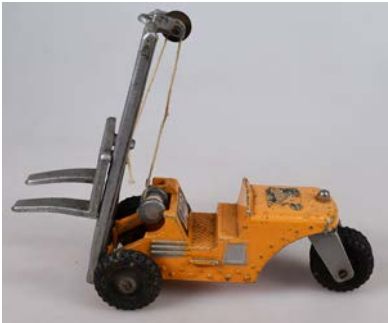
199. JOYTIME FORKLIFT 250mm long, orange, sand cast aluminium, Forklift, partial sticker to rear body, Another JOYTIME Toy Regd Trade Mark, (ex M&B), in working order, forks are bent, minor marks, Very Good 6.5/10