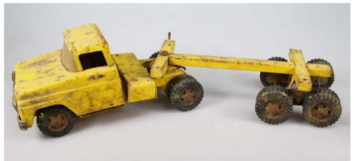
78. TONKA LOGGER MODEL 2008 585mm long, yellow pressed steel, Tonka Logger model 2008, Tonka Toys, USA wheels missing timber & chain, missing three stanchions, major surface rust, paint loss/wear, Fair 5/10