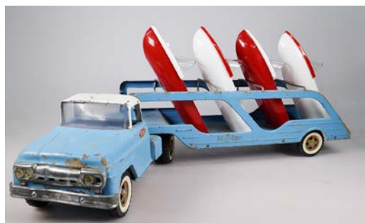
67. TONKA 41 BOAT TRANSPORTER 700mm long, blue with red/white boats pressed steel carrier & plastic boats, Tonka Boat Transport, No. 41, the 4 boats & 2 outboard motors are reproduction, Tonka Mound, Minn stickers to both doors, sticker to underside of cab, Remember Axle Bearings Need Oiling Regularly, (indicates NZ made) missing one headlight, surface rust, paint loss/wear, 7/10