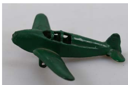
350O. TINK-E TOYS SPITFIRE FIGHTER PLANE 83mm long, 100mm wingspan, green lead, Tink-E Toys Spitfire plane, missing wheels & propellor, Spitfire Fighter Tink-E Toys (an Auckland Company, c1940's) minor paint loss/wear 7/10