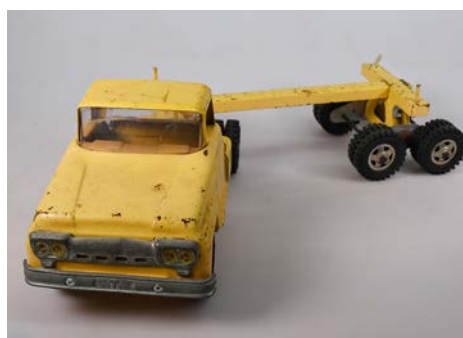
69. TONKA LOGGER MODEL 2008 585mm long, yellow pressed steel, Tonka Logger model 2008, no stickers to show country of manufacturer, missing timber & chain, one replacement pin, surface rust, paint loss/wear, Good 6.5/10