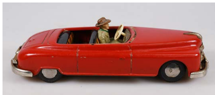
266. ARNOLD CANDIDAT CAR 250mm long, red pressed tin, Candidat Car, Arnold Made In Germany U.S. Zone, Candidat marked to underside, and marketed by Lincoln Toys, clockwork mechanism not tested, missing windscreen, steering wheel is lose, minor surface rust/paint loss, minor marks, Good 7/10