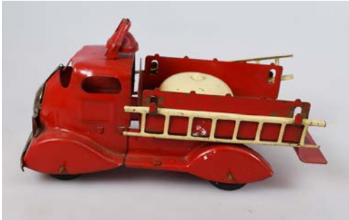
49. TRI-ANG W SERIES FIRE TRUCK 7686/W555 265mm long, red with cream accessories pressed steel, Triang W Series Fire Truck, working bell, Made in New Zealand sticker, rubber wheels, chrome to grill with tarnish minor paint loss/wear, Very Good 8.5/10