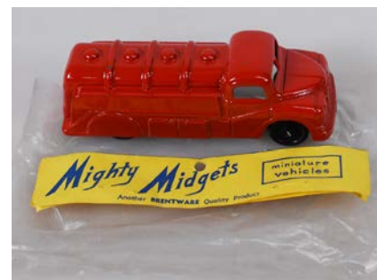
62. BRENTWARE MIGHTY MIDGETS AUSTIN TANKER 110mm long model with original packaging, red Mazac alloy, Brentware Mighty Midgets Austin Tanker, packaging has been opened but has not been played with minor paint loss, Very Good 9/10