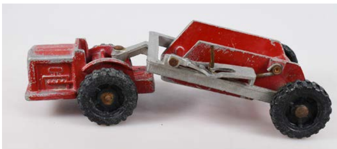
43. FUN HO EARTH SCRAPER 804 280mm long, red Fun Ho model 804 Earth Scraper, wear/paint loss, Good 7.5/10