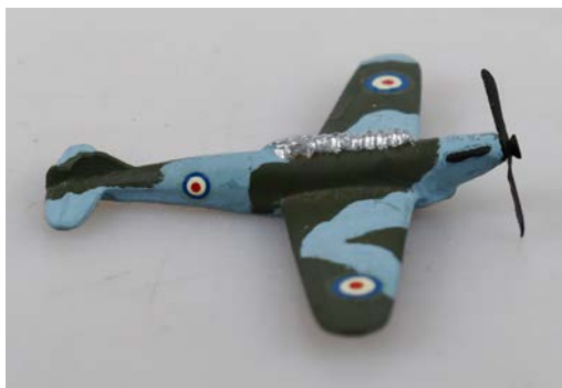
350K. TINK-E TOYS SMALL FIGHTER AIRPLANE 62mm long, 78mm wingspan, green/blue lead, Tink-E Toys Small Fighter Airplane, with propellor, marked Tink-E Toy 22541 USA to underside, (an Auckland Company, c1940's) repainted, minor paint loss/wear 7/10