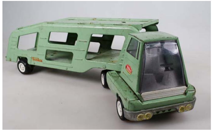
76. TONKA MINI CAR CARRIER 470mm long green pressed steel, Tonka Mini Car Carrier, model 1096, Tonka stickers to sides missing back gate, wear/paint loss, surface rust, Good 7.5/10