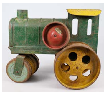
206. HERCULES NZ TOY STEAM ROLLER 285mm long green/yellow/red pressed steel, Hercules, New Zealand Steam Roller, Hercules Toys impressed to front grill and at rear, Hercules Toys decal on flywheel, surface rust, paint loss/wear Good 7/10