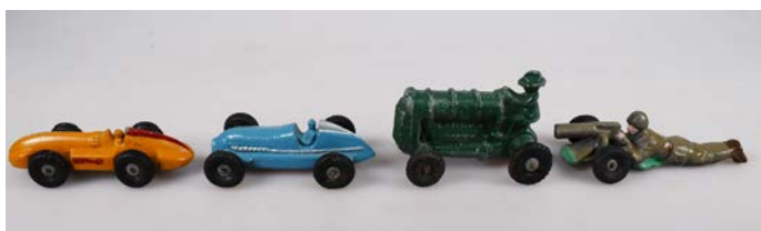
135. TOMMY DOO SLUSH MOULDED LEAD TOYS all Slush Moulded Lead Toys, made by Die Cast Toys Limited, known as Tommy Doo, 105mm long orange, Speed Of The Wind Racing Car plus 93mm long blue, Mercedes Racing Car plus 87mm long green, Tractor plus, 126mm long khaki Soldier lying prone with machine gun, all have very minor paint loss/marks, more so on the tractor, Very Good 8/10 (4)