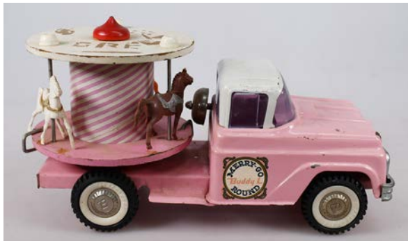
11. BUDDY L MERRY-GO-ROUND TRUCK 320mm long, pink pressed steel Buddy L Merry-Go-Round truck with a wooden & plastic three horse merry go round on the back of the truck, the mechanism is not working, stickers to both doors, light surface rust, minor paint loss/wear to body, paint loss to top of merry-go-round, Very Good 7.5/10