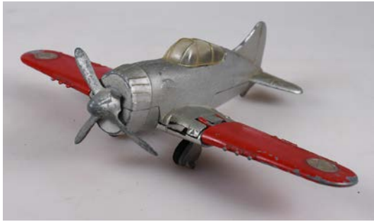
96. LINCOLN MAJOR MODEL NAVY WING FIGHTER 160mm long x 220mm wing span, red/silver Mazac alloy, Lincoln Major Model Navy Wing Fighter, model 4100, folding wings and wheels, ex Hubley U.S.A. dies, cast in New Zealand, one blade of propellor missing, minor paint loss, Very Good 7/10