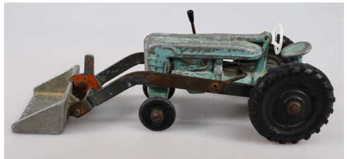
46. FUN HO FARMALL FRONT END LOADER 531 295mm long, teal Fun Ho model 531 Farmall Front End Loader, possible replacement steering wheel wear/paint loss, Good 8/10