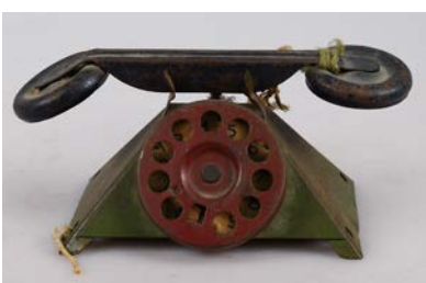
202. HERCULES NZ TOY TELEPHONE 175mm long, green/red dial pressed steel, Hercules, New Zealand Telephone, Hercules Toys decal to rear, spring loaded working dial, rust, paint loss/wear Good 6.5/10