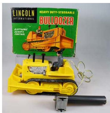
265. LINCOLN INTERNATIONAL HEAVY DUTY BULLDOZER IN ORIGINAL BOX 280mm x 210mm x 130mm, multi coloured box plastic with tin base, Lincoln International Heavy Duty Bulldozer, Cat. 7002, An Empire Made Lincoln International Product, Made In Hong Kong sticker to base, battery operated with electronic hand control, not tested, rips to one corner of cardboard box, minor marks, minor light surface rust to base, one arm of the blade is unattached, one air cleaner broken, minor wear, Very Good 7/10