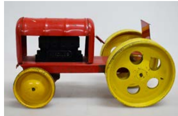
204. HERCULES NZ TOY TRACTOR 310mm long red/yellow pressed steel, Hercules, New Zealand Tractor, Hercules Toys impressed to front grill and at rear, and on engine block, light surface rust, minor paint loss/wear Good 8/10