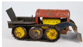
205. HERCULES NZ TOY BULLDOZER 350mm long red/green/yellow pressed steel, Hercules, New Zealand Bulldozer, Hercules Toys impressed to front grill and at rear, and on engine block, with tracks, (extremely rare to find tracks) rust, paint loss/wear, Good 7/10