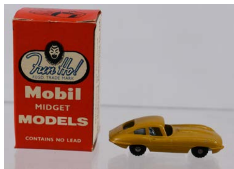
134. FUN HO MIDGET E TYPE JAGUAR 43, BOXED 60mm long box, 54mm long car, mustard diecast, Fun Ho Midget E Type Jaguar No. 43, in original box, Mobil Oil advertising on box Excellent, 9.5/10