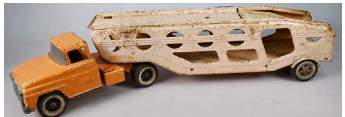
79. TONKA PRESSED STEEL CAR CARRIER 750mm long, orange/yellow pressed steel Tonka Car Carrier, model 2840, no tail gate, yellow rear section faded, repainted, surface rust, paint loss/wear, Good 6/10