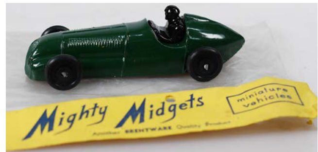
61. BRENTWARE MIGHTY MIDGETS ALFA ROMEO RACING CAR 100mm long model with original packaging, green Mazac alloy, Brentware Mighty Midgets Alfa Romeo Racing Car, packaging has been opened but has not been played with minor paint loss, Very Good 9/10