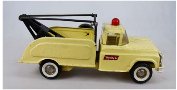
14. BUDDY L WRECK TRUCK 380mm long, yellow pressed steel Buddy L Wreck Truck, Buddy L stickers to both doors, light surface rust, minor paint loss/wear, Very Good 8/10