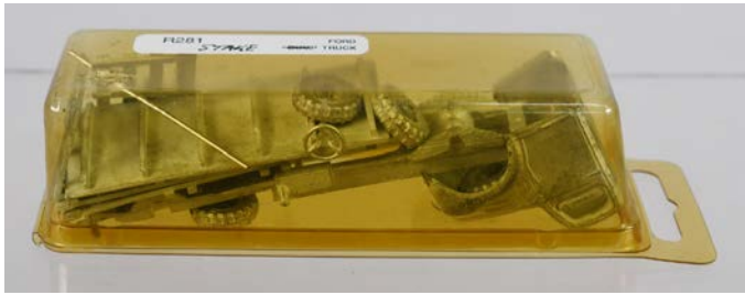
295. RAILMASTER KITSET FORD STAKE TRUCK 140mm long original packaging, unpainted white metal, Railmaster Kitset Ford Stake Truck, unpainted, unassembled, Model R281, (based on Dinky 422 Fordson truck) Very Good 9/10