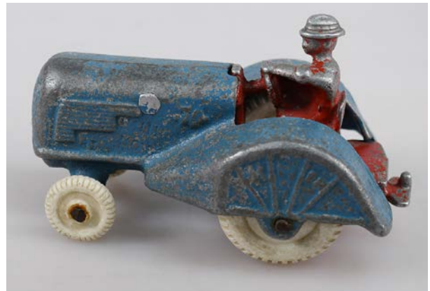
45. FUN HO OLIVER TRACTOR 81 130mm blue/red Fun Ho model 81, Oliver Tractor, with low tow hitch wear/paint loss, Good 7.5/10