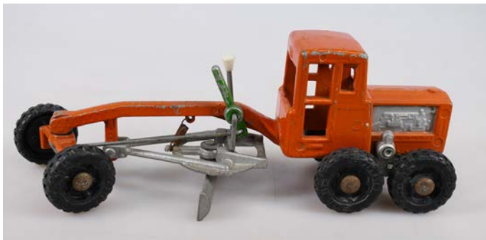
41. FUN HO ROAD GRADER 803 270mm long, orange Fun Ho model 803 Grader, no wheel inserts minor wear/paint loss Good 8/10