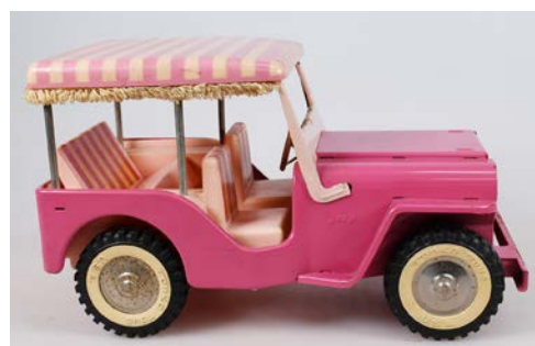
71. TONKA SURREY JEEP 255mm long, vibrant pink pressed steel/plastic, Tonka Surrey Jeep, No. 350, Tonka Mound Minn sticker to rear, missing spare wheel, surface rust, minor wear/paint loss, Very Good 8/10