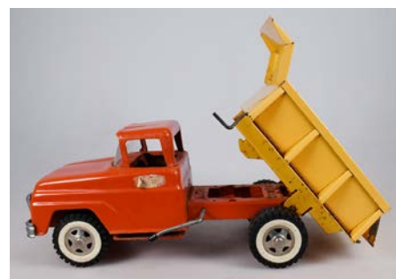
70. TONKA DUMP TRUCK 330mm long, orange/yellow, pressed steel, Tip/Dump Truck, Tonka New Zealand sticker to side, Tonka Toys to tail gate, tipper mechanism in working order surface rust, mostly to underside, minor wear/paint loss, Very Good 8/10