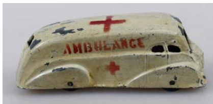
350F. TINK-E TOYS AMBULANCE 92mm long, cream lead, Tink-E Toys Ambulance, with tin wheels, Ambulance & cross painted on body & roof, marked Tink-E Toy with illegible numbers to underside (an Auckland Company, c1940's) paint loss/wear 8/10