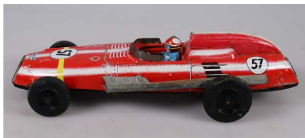
267. RACING CAR, MADE IN JAPAN 255mm long red/yellow pressed tin, No. 57, Racing Car, Made In Japan on console and on one side, believed to have been marketed by Lincoln Toys light surface rust, paint loss/wear, Good 7.5/10