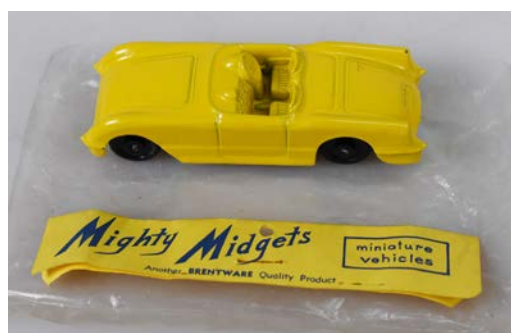
65. BRENTWARE MIGHTY MIDGETS CHEV CORVETTE 100mm long model with original packaging, yellow Mazac alloy, Brentware Mighty Midgets Chev Corvette, packaging has been opened but has not been played with minor paint loss, Very Good 9/10