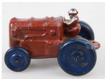
350G. TINK-E TOYS TRACTOR 80mm long, chestnut lead, Tink-E Toys Tractor with tin wheels painted blue, marked Tink-E Toy with illegible numbers to side of engine (an Auckland Company, c1940's) minor paint loss/wear 8/10