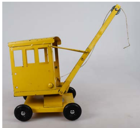
55. TRI-ANG No 1 CRANE 180mm long wheel to wheel, x 270mm tall, yellow pressed steel crane, Tri-ang No. 1, model 40771, no hook, flex between body and base surface rust, paint loss/wear, Good 6.5/10