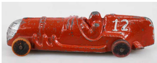
350H. TINK-E TOYS RACING CAR 135mm long red lead, Tink-E Toys Racing Car with wooden wheels, marked Tink-E Toy (an Auckland Company, c1940's) minor paint loss/wear 8/10