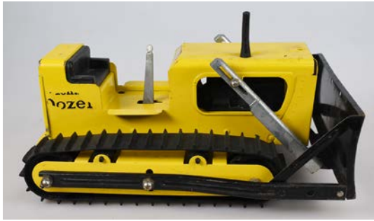
72. TONKA MIGHTY SERIES BULLDOZER 300mm long, yellow/black pressed steel, Mighty Series Tonka Bulldozer, Tonka New Zealand sticker to base, with tracks in working order, minor surface rust, wear/paint loss, Good 8/10