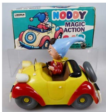
264. NODDY MAGIC ACTION CAR, BOXED 240mm x 125mm tall x 140mm, multicoloured boxed plastic, Noddy Magic Action Car, battery operated, (not tested) Lincoln International, Cat No. 7700, Made In Hong Kong minor wear/marks to box, Very Good 8/10