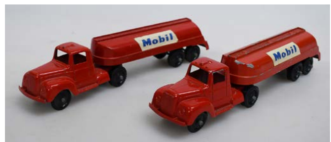
63. BRENTWARE MODEL MOBIL PETROL TANKERS 2 x 227mm long red Mazac alloy, attributed to Brentware, Petrol Tanker with Mobil Stickers to both sides and the back of the tank, marketed at Mobil Petrol Stations, slightly misshaped at rear of tanks, minor paint loss, Very Good 8/10 (2)