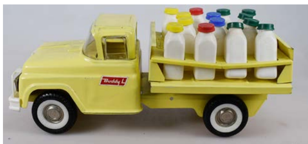
13. BUDDY L STEEL SPRING SUSPENSION MILK TRUCK 355mm long, yellow pressed steel, Buddy L Milk Truck, model 40830, Buddy L stickers to both doors, has front suspension, small splits in the plastic milk bottle holder, minor paint loss/wear, a few light scratches, Very Good 8/10