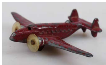
350M. TINK-E TOYS TWIN ENGINE PLANE 98mm long, 140mm wingspan, red lead, Tink-E Toys Twin Engine Airplane, original propellers, marked Tink-E Toy 44/161242 to underside, (an Auckland Company, c1940's) minor paint loss/wear 8/10