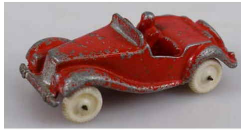
299. FUN HO MG SPORTS CAR 210 100mm long, red diecast Fun Ho model 210, MG Sports Car paint loss/wear, Good 7/10