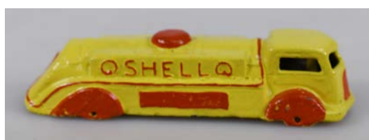
350I. TINK-E TOYS SHELL TANKER 144mm long, yellow/red lead, Tink-E Toys Shell Tanker, no wheels, marked Tink-E Toys 23/3074 to underside, (an Auckland Company, c1940's) has been repainted, minor paint loss/wear 6/10