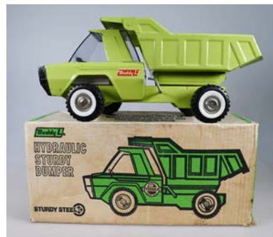
15. BUDDY L BOXED HYDRAULIC STURDY DUMPER TRUCK 360mm long (box) green Pressed steel, Buddy L Hydraulic Study Dumper Truck, model 5532, in original box, Buddy L sticker to one side, Made In New Zealand For The Buddy L Corporation By Tri-ang Pedigree (NZ) Ltd, hydraulic action in working order minor surface rust, paint loss, as new but minor surface rust, paint loss, Very Good 9/10, box has some marks, Very Good 8/10