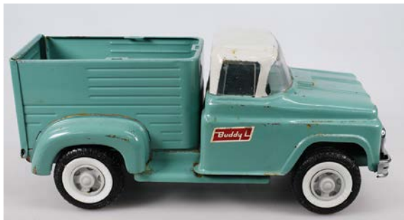
12. BUDDY L HORSE FLOAT 320mm long, teal/white cab roof, pressed steel Buddy L Horse Float, model 40813, has front suspension, missing perspex screen over body of float, light surface rust, minor paint loss/wear Very Good 8/10