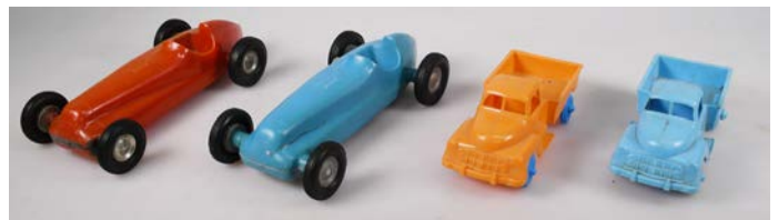
301. PLASTIC RACING CARS & TRUCKS 2 x 235mm long red & blue with black wheels plastic, Clockwork Racing Car, marked to underside, MFD by Rite spot plastic Product Glendale Calif, Made In U.S.A., red example mechanism is working, crack to side of seat, repairs to front axle area, Good 5.5/10 plus blue example, mechanism not working, crack to front right hand axle & left hand side of bonnet area, Good 5.5/10 plus 2 x 165mm long orange & blue plastic Trucks, no makers marks, possibly New Zealand made, broken strut to blue example, orange Very Good 8/10 plus blue, Good 6.5/10 (4)