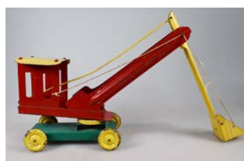
207. HERCULES MECHANICAL SHOVEL EXCAVATOR 215mm long, x 285mm tall, red/yellow/green pressed steel, Hercules Mechanical Shovel Excavator, 2 axle version light surface rust, paint loss/wear, Very Good 8/10