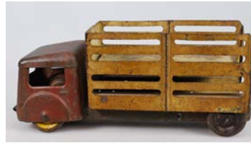
203. HERCULES NZ TOY SHEEP TRUCK TWIN DECK 310mm long, red/fawn pressed steel, Hercules, New Zealand Twin Deck Sheep Truck, missing grill dints to back frame, surface rust, paint loss/wear Good 6.5/10