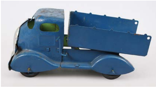
48. TRI-ANG W SERIES SWB TIP TRUCK 240mm long, blue with silver grill pressed steel, Tri-ang W Series Short Wheel Base, Tip Truck, was originally green, overpainted in blue, grill overpainted to silver, no tail gate, tipping mechanism operational minor surface rust, minor paint loss/wear, Good 5/10