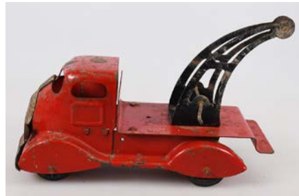
52. TRI-ANG W SERIES SWB BREAKDOWN TRUCK 240mm long, red with black crane, pressed steel, Tri-ang W Series Short Wheel Base, Breakdown Truck, no string or hook, made in New Zealand sticker, remains of price sticker 15/11 minor surface rust, minor paint loss/wear, Good 7/10