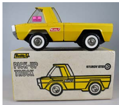
16. BUDDY L BOXED PICK UP TRUCK 360mm long (box) yellow/black Pressed steel, Buddy L Pick Up Truck, model 5504, in original box, Buddy L sticker and It Steers to one side, Made In New Zealand For The Buddy L Corporation By Tri-ang Pedigree (NZ) Ltd as new but surface rust mostly on front end, minor marks, Very Good 8/10 box has minor marks, Very Good 9/10