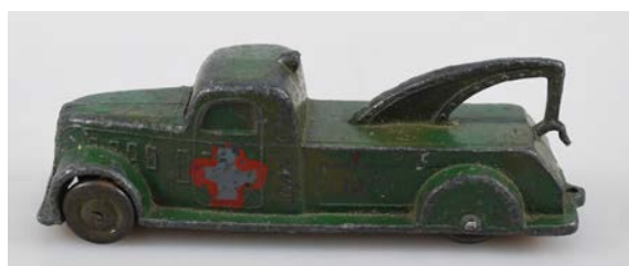
350J. TINK-E TOYS BREAKDOWN TRUCK 140mm long green lead, Tink-E Toys Breakdown Truck, with tin wheels, marked 21/5941 paint loss/wear 8/10