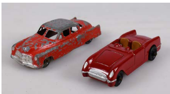
66. BRENTWARE MODEL CHEV CORVETTE, CADILLAC SEDAN VEHICLES 100mm long, red Mazac alloy, Brentware Chev Corvette, repainted to a high level, Very Good 8/10 plus 116mm long red Mazac alloy, Brentware Cadillac Sedan paint loss, Good 7/10 (2)