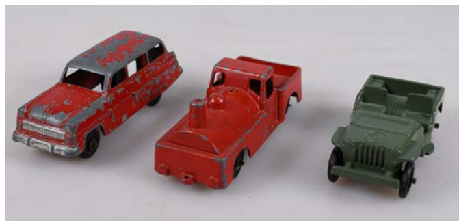
137. BRENTWARE MODEL FORD ESTATE CAR, RAILWAY LOCOMOTIVE, JEEP VEHICLES 100mm long, red Mazac alloy, Brentware, Ford? Estate, paint loss, Good 6.5/10 plus 100mm long, red Mazac alloy, Brentware, Railway Locomotive minor paint loss, Very Good 8/10 plus 83mm long green Mazac alloy, Brentware, Jeep very minor paint loss, Very Good 9/10 (3)