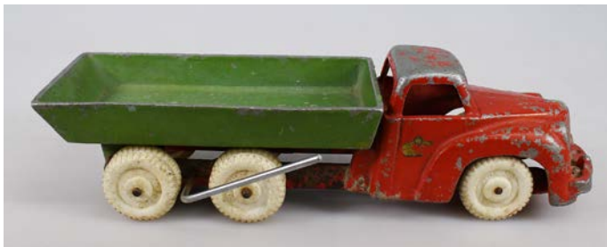
42. FUN HO LARGE TIP TRUCK 502 320mm long, red/green Fun Ho model 502 Large Tip Truck, late version paint loss/wear, surface rust on steel frame, Good 7.5/10