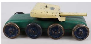
201. HERCULES NZ TOY MILITARY TANK 245mm long, green/cream pressed steel, Hercules, New Zealand Military Tank, Hercules Toys sticker on turret, missing tracks light surface rust, minor paint loss/wear Good 7.5/10