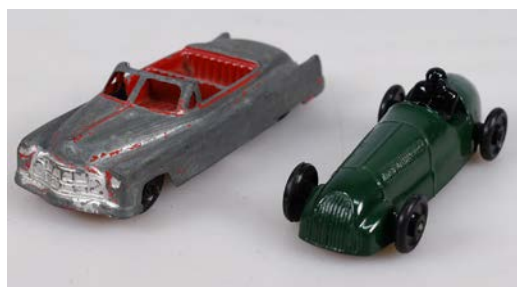
140. BRENTWARE MODEL, CADILLAC CONVERTIBLE, ALFA ROMEO RACING CAR VEHICLES 117mm long red Mazac alloy, Brentware Cadillac Convertible significant paint loss, windscreen complete which is unusual, these often get broken, Good 6.5/10 plus 98mm long, green Mazac alloy, Brentware, Alfa Romeo Racing Car, original condition, Excellent 9.5/10 (2)