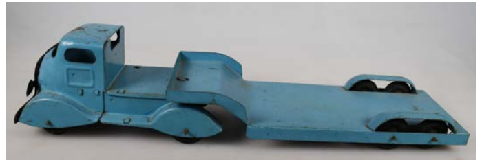
53. TRI-ANG W SERIES ARTIC LOW LOAD LORRY WITH TRAILER 7684/W553 485mm long, blue with black grill pressed steel, Triang W Series Articulated Low Load Lorry with Trailer, Made in New Zealand, rubber wheels, minor surface rust, minor paint loss/wear, Very Good 8.5/10