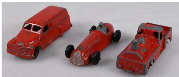
138. BRENTWARE MODEL ALFA ROMEO, RAILWAY LOCOMOTIVE, CHEV PANEL VAN 102mm long, red Mazac alloy, Brentware, Chev Panel Van paint loss, Good 7/10 plus 98mm long, red Mazac alloy, Brentware, Alfa Romeo Racing Car, paint loss, Good 7.5/10 plus 100mm long, red Mazac alloy, Brentware, Railway Locomotive paint loss, Good 7/10 (3)