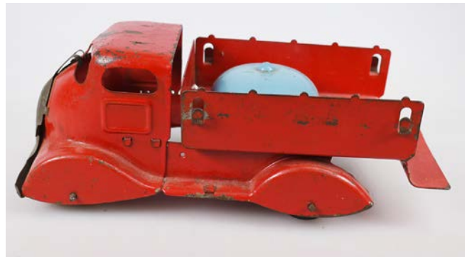
54. TRI-ANG W SERIES FIRE TRUCK 7686/W555 265mm long, red with blue accessories pressed steel, Triang W Series Fire Truck, working bell, but missing decorative cab roof bell, no ladders, Made in New Zealand sticker, rubber wheels, missing both headlights, minor paint loss/wear, light surface rust Good 5.5/10