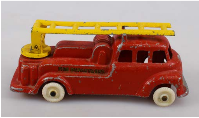
40. FUN HO FIRE ENGINE SWIVEL LADDER 518 180mm long, red Fun Ho model 518, Fire Engine with swivel ladder, Fire Department decals to sides, Fun Ho decal to rear, early version small split in one back wheel, wear/paint loss, Very Good 8/10