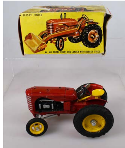
100. LINCOLN TOYS MAJOR MODELS TRACTOR 160mm long boxed toy, red/yellow diecast, Lincoln Toys Major Models, Tractor, With Rubber Tyres, Articulated Steering, Wheel Control, Lincoln International, Empire Made, (Hong Kong) missing exhaust & air cleaner, very minor paint loss, box has been cut down to the size of a tractor, Very Good 8/10