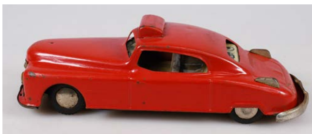
270. ARNOLD FIRE CHIEF CAR 250mm long, red pressed tin, Fire Chief car, believed to be Arnold Toys Germany but no markings, marketed by Lincoln Toys, minor surface rust/paint loss, minor marks, Good 8/10