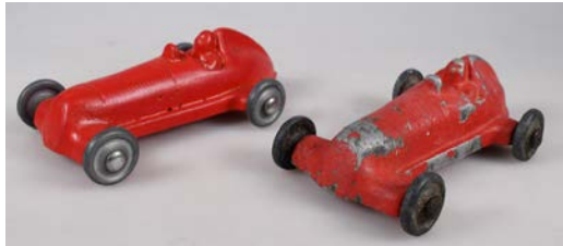
296. YEEHA NZ MADE RACING CARS 177mm long, red sand cast aluminium Yeeha racing cars, made in Napier by Barry Hughes, c1994, paint loss/wear to one, Good 7/10, plus minor marks to the other, Very Good 9/10 (2)