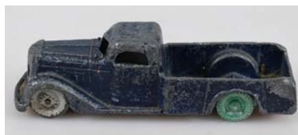
350N. TINK-E TOYS LARGE PICK UP TRUCK 135mm long blue lead, Tink-E Toys Large Pick Up Truck with tin wheels to front, plastic wheels to rear, marked Tink-E Toy with illegible numbers to underside (an Auckland Company, c1940's) paint loss/wear 7/10