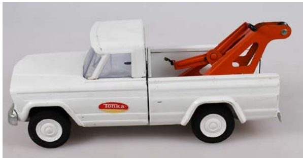
74. TONKA JEEP PICK UP TRUCK 240mm long, white/orange pressed steel, Tonka Mini Series Jeep Wrecker, model 1068, Jeep to front bumper, Tonka New Zealand stickers to sides, Kiwi sticker to underside, missing hook & tailgate, surface rust to front bumper, minor wear/paint loss, Very Good 8/10