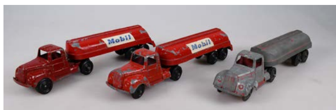
141. BRENTWARE MODEL MOBIL PETROL TANKERS 2 x 227mm long red Mazac alloy, attributed Brentware, Petrol Tanker with Mobil Stickers to both sides and the of the tank, marketed at Mobil Petrol Stations one cab has been repainted, in a slightly darker colour, paint loss, Good 7/10 plus the same model, no stickers to tank, significant paint loss, damage to rear, Good 5/10 (3)