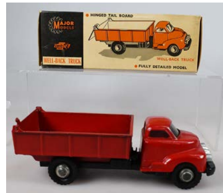
100A. LINCOLN TOYS MAJOR MODELS WELL BACK TRUCK 210mm long boxed toy truck, red diecast, Lincoln Toys, Major Models, Well-Back Truck, Hinged Tail Board, Cat. No. 4106, Made In New Zealand By Lincoln Industries Ltd, Auckland, both the box and model has the price 18/9 marked on it very minor paint loss, minor damage to box, small rip to one end, Very Good 9/10