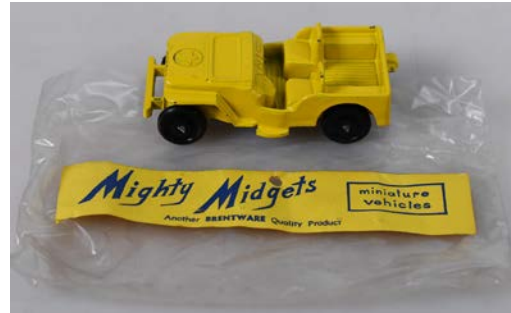
60. BRENTWARE MIGHTY MIDGETS JEEP 80mm long model with original packaging, yellow Mazac alloy, Brentware Mighty Midgets Jeep, packaging has been opened but has not been played with minor paint loss, Very Good 9/10