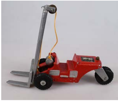
198. JOYTIME FORKLIFT 250mm long, red, sand cast aluminium, Forklift, sticker to rear body, Another JOYTIME Toy Regd Trade Mark, (ex M&B), in working order, minor marks, Very Good 8/10