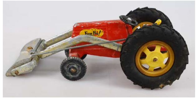
44. FUN HO MEDIUM FRONT END LOADER 532 250mm long, red/yellow Fun Ho model 532 Medium Front End Loader, early version, Fun Ho decals on engine wear/paint loss, Good 7.5/10