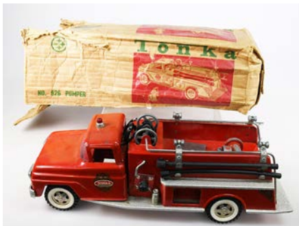
75. TONKA PUMPER 440mm long, red in box pressed steel, Tonka Pumper Fire Engine, model 926, with Fire Hydrant, Tonka Mound Minn stickers to sides, Remember Axle Bearings Need Oiling Regularly to underside (this sticker exclusively used in New Zealand only) Tonka Toys made In New Zealand to rear, boxed marked Made In New Zealand Under Licence some accessories have been replaced, hoses, ladder locker doors (not fitted), box in poor condition, light surface rust, minor paint loss/wear, Good 7.5/10