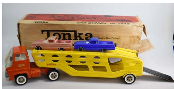
68. TONKA PRESSED STEEL CAR CARRIER 720mm long yellow pressed steel Tonka Car Carrier, model 2840, with 2 plastic Falcon Utes, Turbine Cab version, Tonka N.Z. wheels, box has Made In New Zealand, printed to two sides, sellotape marks & storage wear to box, one falcon has broken roof struts, faded, minor surface rust, wear/paint loss, Good 8/10