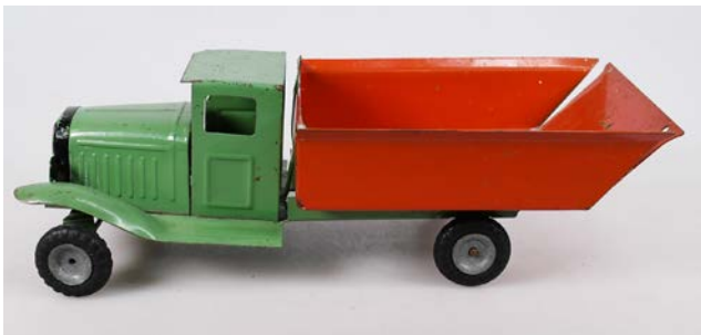
51. TRI-ANG 0 SERIES TIP TRUCK 320mm long, green/red pressed steel, Tri-ang 0 Series Tip Truck, grill & headlight have been overpainted, minor surface rust, minor paint loss/wear, Very Good 8/10