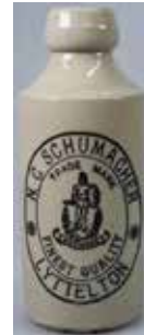
170. SCHUMACHER LYTTELTON GINGER BEER GB294, all white dumpy, internal thread, N C Schumacher Lyttelton, Soldier trademark, Bourne 5 potters marks, minor base edge glaze miss/chip to rear, minor marks, Very Good 9/10