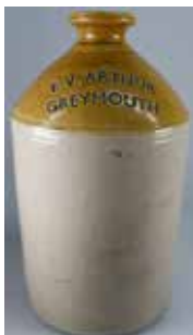
142. ARTHUR GREY MOUTH GROGERS STONE JAR 1 Gallon, 2 tone stoneware jar, stoneware handle, impressed E V Arthur Greymouth, Stour Ware Timaru potter, minor marks, Very Good 9/10