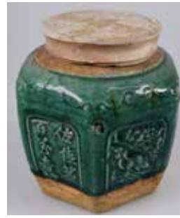
577. CHINESE GINGER JAR 140mm tall, elaborately decorated 6 sided ginger jar in rich green glaze, original lid, Very Good, 9/10