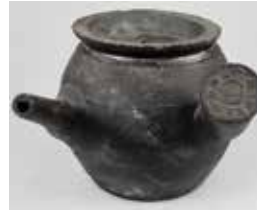
566. CHINESE COOKING POT 135mm tall, unusual designed Chinese cooking pot, characters to end of handle say 'Hou Wan domestic ceramic factory', blackened ceramic finish, 2 minor rim edge chips, light wear, Very Good 8.5/10