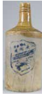
564. WING LEE WAI CHINESE WHISKY 220mm tall two tone stoneware Chinese bottle, blue print Chinese characters and words inside a shield, minor base edge chip, crazing, Good, 7/10