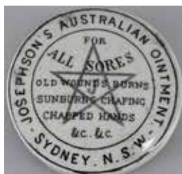
349. JOSEPHSON'S AUSTRALIAN OINTMENT SYDNEY POT LID 60mm diameter Black and White Pot Lid, Josephson's Australian Ointment for all sores, old wounds burns, sunburns chafing, chapped hands, &c. &c. Sydney NSW, J in a Star of David to centre, crazing, minor staining, small rim edge chip, minor inner rim chip, Very Good 8/10