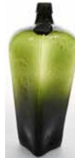
552. LOOPUYT SEALED GIN 320mm very tall!, dark green, shoulder seal, P. Loopuyt & Co - Schiedam, with a Hour Glass picture, rough rim edge, minor marks, Very Good 8/10