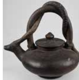
565. EARLY BALINESE FIGURAL TEAPOT 210mm x 230mm wide, early teapot, Balinese origin, serpent head and twisted handle, unglazed red earthenware pottery with a fire blackened patina, a section of the lid has been broken and reglued, no makers marks, light wear, Very Good 7/10