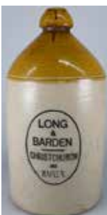
155. LONG & BARDEN CHRISTCHURCH AND NAPIER STONE JAR CABC 227, 1 gallon, 2 tone stoneware, no handle, Long & Barden Christchurch and Napier, no maker, Mauri Bros noted in book, impressed S to shoulder, small potstone/glaze fault to rear, minor marks, Very Good 9/10