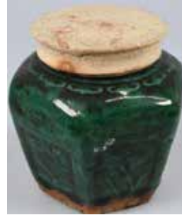
578. CHINESE GINGER JAR 108mm tall, elaborately decorated 6 sided ginger jar in dark green glaze, original lid, Very Good, 9/10