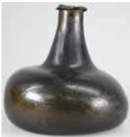
118. ENGLISH ONION BOTTLE 148mm tall, early circa 1690's English Made Onion Wine Bottle, overall light wear, rim edge has large sliver type chip, open pontil marks to base, classic early bottle, Very Good 7/10