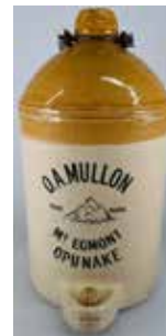
159. MULLON OPUNAKE STONE JAR 1 gallon, 2 tone stoneware jar, wire/metal handle, spigot, O A Mullon Mt Egmont Opunake, Trade Mark image of Mount Egmont, minor marks, Very Good 9/10