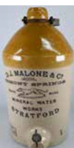
156. MALONE STRATFORD STONE JAR 1 gallon, 2 tone stoneware jar, wire & metal handle, spigot & tap, D J Malone & Co Egmont Springs Mineral Water Works Stratford, Greyhound Trade Mark, Number 1, the first one made, patchy manufacturing glaze to right hand shoulder, minor marks, Very Good 9/10