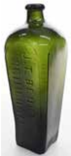
548. BEUKERS GIN 285 mm tall, dark green, pig snout, embossed to 2 panels, J T Beukers Schiedam, large kick up with numerals 60, Very Good, 9/10