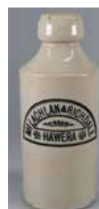
162. MCLACHLAN & RICHDALE HAWERA GINGER BEER GB 224, all white, blob top, internal thread, McLachlan & Richdale Hawera, small rim edge bruise, two base edge chips, minor marks, Very Good 8/10