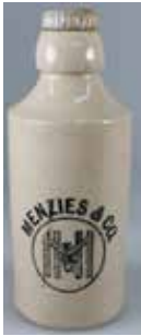
163. MENZIES & CO GINGER BEER GB239, Rarity 4-6, all white blob top internal thread, Stiff E potter, Menzies & Co, (missing the Ginger Beer usually seen), entwined letters Trade Mark, plain white ceramic stopper, minor base edge chip, Very Good 8.5/10