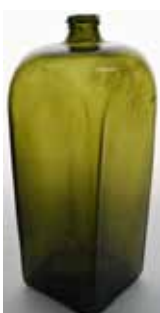
550. EXTRA LARGE FREE BLOWN SQUARE GIN 295mm tall, free blown extra large square (not tapered) gin, large pontil pipe scar to base, possibly made in USA, very early item, minor nibble to a corner edge near base, minor scratches/marks, Rare & Unusual item, Very Good 8/10