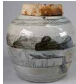
579. CHINESE GINGER JAR 167mm tall, elaborately decorated with Chinese designs, original lid, staining to body and 20mm hairline off rim edge, Very Good, 7/10