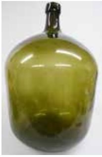
545. EARLY FREEBLOWN CAR BUOY 500mm tall, fantastic early free blown Car Buoy, applied top, mid olive green, smooth base, uneven when sitting, light wear/marks, Very Good 9/10