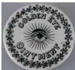
347. GOLDEN EYE OINTMENT POT LID 47mm diameter black and white Pot Lid, Golden Eye Ointment with an eye to the centre and a decorative border, minor marks, Very Good 8.5/10