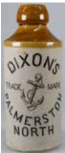
16. DIXON'S PALMERSTON NORTH GINGER BEER GB86, dumpy tan top blob top, Dixon's Palmerston North, Anchor Trade Mark, Pearson potter, minor rim edge chip, chip to rear shoulder and accompanying 130mm crack, scuffs to the rear, other minor marks, Very Good 7.5/10