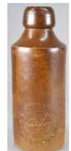
367 GORMAN NELSON GINGER BEER GBI-39, all over salt glazed, cork stoppered, T Gorman Nelson, 3 stars inside triangle Trade Mark, Lovatt 1901 potter, kiln kiss to rear shoulder, very minor rim edge wear, minor base edge chip, light wear, Very Good 8/10