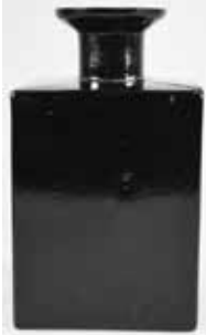
116. BLACK GLASS PERFUME BOTTLE 127mm tall, early square shape with flared lip, (stopper absent) very dark black glass, minor marks, Very Good 9/10