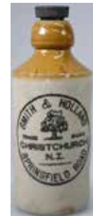
172. SMITH & HOLLAND CHRISTCHURCH GINGER BEER GB308, tan top dumpy, Rarity 6-8 known, Smith & Holland Springfield Road Christchurch NZ, Tree as trademark, Mauri Bros potters marks, front edge base edge chip, rim edge chips, nibbles to shoulder edge, A Very Rare Ginger Beer, Good 7/10