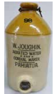
153. JOUGHIN PAHIATUA STONE JAR 1 gallon, 2 tone stoneware jar, wire handle, spigot & tap, W Joughin, Aerated Water & Cordial Maker Pahiatua, Skey 9 Tamworth Potter, small impact bruise and crack to side of spigot, scrapes to upper body and shoulder, minor marks, Very Good 8/10