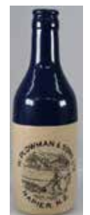
167. PLOWMAN NAPIER GINGER BEER GB 269, Blue top, crown top, W Plowman & Sons Ltd Napier NZ, picture of a farmer ploughing his field with mountain scene behind him, Bourne 27 potter, property rights to the rear, major repairs to the top, and base edge, 2 hairlines to lower rear through the property rights, The All Time Classic NZ Ginger Beer, Good 6/10