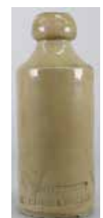
368. MOFFETT INVERCARGILL GINGER BEER GBI-52, blob top, cork stoppered, cream body, impressed N J Moffett Invercargill, rough rim edge, light wear and marks, small glaze chip to rear body, small base edge chip, Very Good 8/10