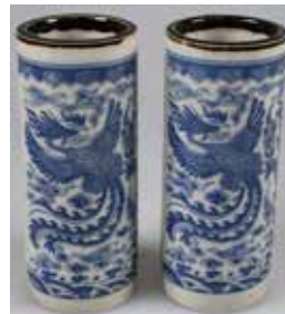
568. BLUE & WHITE CHINESE CALLIGRAPHY POTS 130mm tall, pair of Blue & White ceramic Chinese made calligraphy pots, Dragons within the pattern, Chinese characters to the base, fine crazing, Very Good (2)