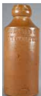
362. CURTIS LYTTTELTON GINGER BEER GBI-18, CABG_609 salt glazed Internal Thread, impressed Curtis & Co Lyttelton, Doulton & Co12 potters, 2 tiny fleabite nibbles to shoulder, minor marks, Very Good 9/10