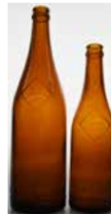
233. NEWBIGIN HASTINGS CROWN TOP BEERS Beer 233, 26oz amber crown top, DH Newbigin Hastings, Leopard in diamond Trade Mark, Made in NZ AGM to base, minor marks, Very Good 8.5/10 plus Beer 234, 12oz amber crown top, DH Newbigin Hastings, Leopard in diamond Trade Mark, Made in NZ AGM to base, minor marks, tiny bruise to left of Leopard, Very Good 8/10 (2)