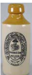
19. DODSON NELSON GINGER BEER GB96, tan top blob top, Dodson & Son Nelson Ye Old Fashioned Fermented Ginger Beer, picture of Lord Nelson as Trade Mark, Bourne 13 potter, fine 85mm long hairline to the right hand side of transfer, minor marks, Very Good 8/10