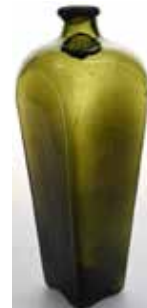
554. FREE BLOWN SEALED CASE GIN 280mm tall, pig snout top, olive green, free blown with shoulder seal W H, (W. Hasekamp), numeral 1 on base, light wear/scratches, minor rim bruise bruise, Very Good 7.5/10