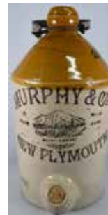
160. MURPHY NEW PLYMOUTH STONE JAR 1 gallon, 2 tone stoneware jar, metal handle & spigot, Murphy & Co New Plymouth, Pearson potter, Mount Egmont as a Trade Mark, crack to rim edge & lip, 2 base edge chips, minor marks, Very Good 7.5/10