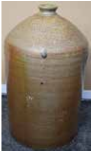
152. JAS SHAND CHRISTCHURCH 5 GALLON STONE JAR 5 Gallon, salt glaze stoneware jar, impressed to shoulder Jas Shand & Co Limited H2 Christchurch, unmarked Lambert potteries Dunedin, rim edge chips, some white paint spots to body, Very Good 8/10