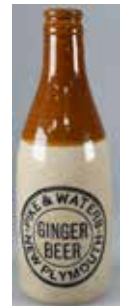
166. PIKE & WATERS NEW PLYMOUTH GINGER BEER GB265, Tan Top, Crown Top, Pike & Waters Ginger Beer New Plymouth, Price Bristol potter, green mark and line to rear, minor marks, Very Good 9/10