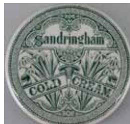
354. SANDRINGHAM COLD CREAM POT LID 78mm diameter Pot Lid with green glaze, Sandringham Cold Cream, with fancy pattern of flowers, crazing, minor marks, Very Good 8.5/10