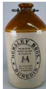
148. HEMSLEY BROS DUNEDIN STONE JAR 1 gallon, 2 tone, stoneware jar, wire handle, Hemsley Bros Dunedin, Stour Ware Timaru potters mark, minor marks, Very Good 9/10