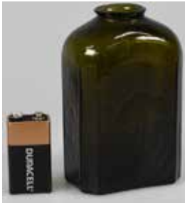
558. BLACK GLASS SNUFF 106mm tall, Olive Amber snuff, American made, large letter F on base along with pontil, Very Good 9/10