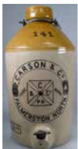
143. CARSON PALMERSTON NORTH STONE JAR 1 Gal, 2 tone stone jar, wire & metal handle, with spigot & tap, Carson & Co Palmerston North, Maltese Cross Trade Mark, unusual stoneware stopper stuck in place, Pearson potter, minor marks, Very Good 9/10