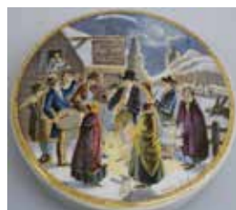
356. XMAS EVE PRATT LID Mortimer 323a, 72mm diameter Pratt Pot Lid, Xmas Eve, colourful outdoor scene of music being played in the street, Registration diamond to lower front, Very Good 9/10