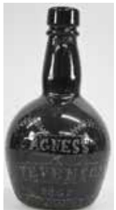
131. AGNESS STEVENSON 1867 ETCHED LIQUOR BOTTLE 167mm tall, very dark olive amber green, small size squat liquor bottle, pontilled, etched to one side Agness Stevenson 1867 with decoration, Very Good 9/10