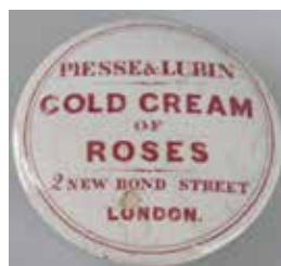
353. PIESSE & LUBIN COLD CREAM POTLID AND HOLLOWAY'S POTS 66mm diameter Pot Lid, red writing, Piesse & Lubin Cold Cream of Roses 2 New Bond Street London, chip to face above London, some scratches to face, under flange chip and base edge chips, Good 6.5/10 plus Holloway's Ointment pot, non pictorial earlier version, 244 Strand London rim edge chip, light marks, Very Good 7.5/10 plus Holloway's Ointment, pictorial, covered breasts version, 33 Oxford Street, London, minor marks, Very Good 9/10 (3)