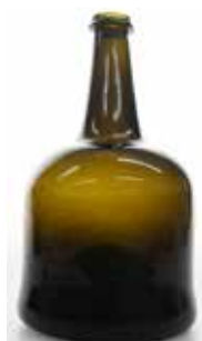
120. FREEBLOWN ENGLISH MALLET WINE BOTTLE 214mm tall, free blown with string rim, circa 1740's, pontilled, base slightly saggy, top edge de-corking chipping, Very Good 8/10