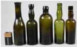
560. ASSORTED MINIATURE SPIRIT BOTTLES 150mm tall to 133mm tall, Olive Green Amber, c1850-1910, all unembossed, all have minor marks, left to right, small rim edge chip, Very Good 8/10 plus dull patches Very Good 8/10 plus pontil scar to base, Very Good 9/10 plus the last two Very Good 8.5/10 (5)