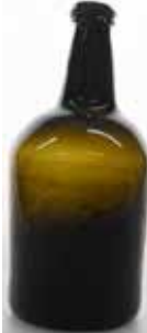
134. EARLY ENGLISH SQUAT FREE BLOWN WINE BOTTLE 223mm tall, dark olive amber, double collar lip, pontil base, full body gloss, an Early English Wine bottle, Very Good 9/10