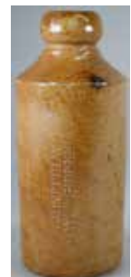
365. DIXON WELLINGTON GINGER BEER GBI-25, all over salt glaze, cork stoppered, George Dixon Wellington, written vertically, Lion and GD to rear, no potter, tint shoulder chips, minor marks, Very Good 8/10