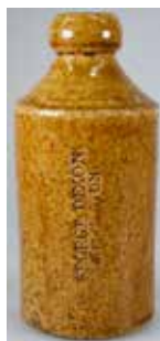
364. DIXON WELLINGTON GINGER BEER GBI-26, all over honey glaze, cork stoppered, George Dixon Wellington, written vertically, Lion and GD to rear, no potter, minor marks, Very Good 9/10