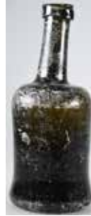
133. EARLY FREE BLOWN SMALL WINE 153mm tall, free blown, pontilled, with an all over patina of wear/burial marks, saggy to base, Very Good 7/10