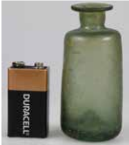
559. VERY OLD PHIAL 81mm tall, cylindrical phial, kick up with pontil to base, all over dull/wear reflecting the age, light scratches, Very Good 8/10