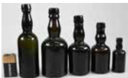
562. BLACK GLASS MINIATURE WHISKIES 143mm tall to 71mm tall, Olive Green Amber, c1880-1910, all unembossed, all minor marks, Very Good 8.5/10 (5)