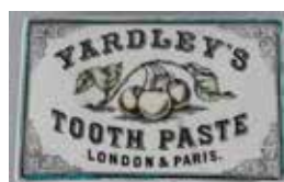
357. YARDLEY'S TOOTH PASTE OBLONG POT LID 83mm x 54mm rectangular Pot Lid, Yardley's Tooth Paste London & Paris central image of cherries on a branch, fading to cherries and leaves, some fading to blue border, minor marks, Very Good 8.5/10