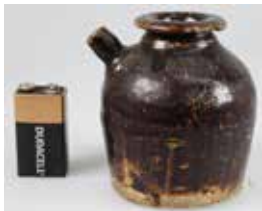
574. CHINESE SOY SAUCE SMALL POT 85mm tall, small sized Soy Sauce pot with pouring spout, chip to underside rim edge, Rare small size, Very Good 8/10