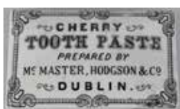
350. McMASTER HODGSON & CO DUBLIN OBLONG POT LID 83mm x 50mm black and white rectangular Pot Lid, Cherry Tooth Paste Prepared by McMaster, Hodgson & Co Dublin, under rim edge chips, fine crazing, minor marks, Very Good 8/10