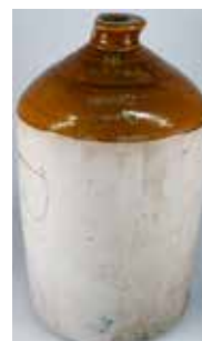
149. HOLE & CO TIMARU 2 GALLON STONE JAR 2 Gallon, 2 tone, stoneware jar, impressed to shoulder, J Hole & Co Timaru 2 Gallons, large and small rim edge chips, DW marked to body, Good 6.5/10