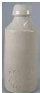
360. COOPER WELLINGTON GINGER BEER GBI-13, all over white, cork stoppered, impressed G Cooper Wellington, with crossed Keys Trade Mark, no potter, small under base edge chip, Very Good 8.5/10