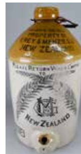
147. GREY & MENZIES NEW ZEALAND STONE JAR 1 gallon, 2 tone stoneware jar, wire handle, and spigot, Grey and Menzies Ltd New Zealand, with fern frond decoration, Pearson potter, tiny chip to spigot and some discolouration to spigot area, Very Good 9/10