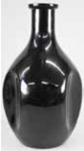
128. 3 SIDED BLACK GLASS DIMPLED WHISKY BOTTLE 205mm tall, 3 piece moulded 3 sided black glass (can't see through it!), each panel has a recess (similar to Haig's Dimple Whisky Bottle), smooth base, rim edge chip, high gloss, Very Good 7.5/10