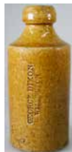
366. DIXON WELLINGTON GINGER BEER GBI-26, all over honey glaze, cork stoppered, George Dixon Wellington, written vertically, Lion and GD to rear, no potter, light shoulder wear, minor marks, Very Good 8.5/10