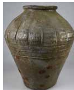
569. LARGE CHINESE RICE WINE STORAGE JAR 265mm tall, terracotta body, greenish toned glaze, shoulder decoration, rim edge glaze chip, body has spots of missing glaze, remnants of a wax seal to shoulder, Very Good 7/10