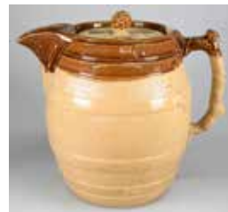
300B. COLONIAL POTTERY LIDDED JUG Large 225mm tall jug with lid, has acorns on branch to either side of the handle, and on handle, lid has acorn as a handle, unknown early New Zealand Colonial pottery?, chip to pouring spot and inner rim near handle, crazing, tiny chip to lid, Very Good 7.5/10