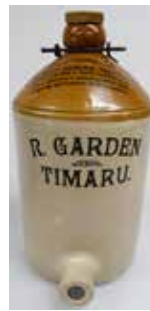
145. GARDEN TIMARU STONE JAR 1 gallon, 2 tone stoneware jar, wire handle and spigot, R Garden Timaru, R Garden Timaru stoneware stopper, minor marks, Very Good 9/10