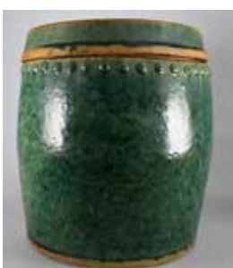
563. CHINESE POT AND LID 320mm tall, to top of lid, 255mm wide across lid, large bulk storage pot and lid in a green glaze, it has Chinese symbols to the outside rim edge which is covered when lid is on, and Made In China to base in red print, small rim edge chip on the pot, the lid has a 200mm crack, that's been glued to the underside to stabilize it and a section of the rim edge has been broken and reglued, minor marks, displays well, Very Good 7.5/10