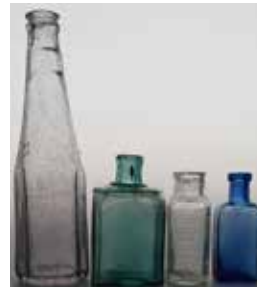
580. CHINESE GLASS BOTTLES L-R, 210mm tall, unusual top, circa 1920's clear/amethyst glass sauce bottle, Koon Yick embossed to one side with Chinese writing to other, Koon Yick Wah Kee Chilli sauce from Hong Kong is still available today, VG 9/10, plus 100mm light green square bottle with chamfered shoulder, Chinese characters to base, rim edge chip 7/10, plus 90mm tall clear glass cylindrical bottle, spun lip, has Chinese characters vertically one side, VG 8/10, plus 85mm tall, pale blue flat sided medicine, has Chinese characters faintly embossed to one panel, recessed front panel, and side groove to rear, VG 8.5/10 (4)