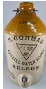
146. GORMAN NELSON STONE JAR 1 Gallon 2 tone, wire handle, spigot & tap, plain wooden stopper, T Gorman Aerated Water Works Nelson, 3 Stars in triangle Trade Mark, Pearson potter, small rim edge bruise/crack, tiny chip to spigot, minor marks, Very Good 8.5/10