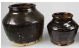
575. CHINESE FOOD STORAGE JARS 135mm & 100mm tall, Chinese Storage Jars, wide mouth, brown glaze, all Very Good 9/10 (2)