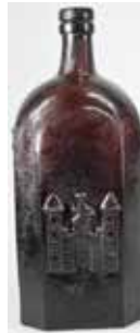
136. KRUMMEL MAGDEBURG LIQUEUR BOTTLE 238mm tall dark red amber, applied top, J Krummel & Co Magdeburg to side panels and a Castle with figure Trade Mark, has lost some of its sheen, minor marks, Very Good 8/10