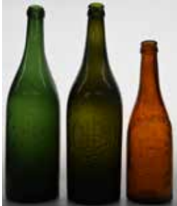
225. BARRY GISBORNE BEERS Beer Ring Seal 3, 26oz, applied top, dark teal green, D J Barry Gisborne, B on base, minor marks, Very Good 9/10 plus Beer 56, 26oz, Dark Olive Black, Applied Top, Crown Top, D J Barry Gisborne with intertwined initials Trade Mark, tiny base edge bruise, Very Good 9/10 plus Beer 63, 12oz, amber, ABM crown top, D J Barry Gisborne with intertwined initials Trade Mark, minor marks, Very Good 9/10 (3)