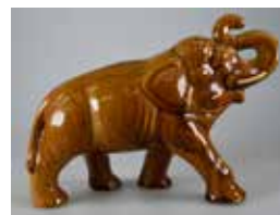
301. BENHAR LARGE TAN ELEPHANT 190mm tall x 265mm Tan Elephant, unmarked but attributed to Benhar Potteries, painted tusks and eyes, light crazing, Very Good 9/10