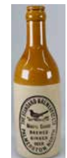
173. STANDARD BREWERY PALMERSTON NORTH GINGER BEER GB309, tan top, crown top, The Standard Brewery Co Ltd Magpie Brand Brewed Ginger Beer Palmerston North, Magpie as Trade Mark, no potter, impressed 26 to base edge, minor marks Very Good 9/10