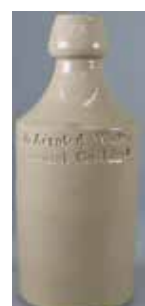
369. NZ AERATED WATER & CORDIAL CO GINGER BEER GBI-58, all over white, blob top, cork stoppered, NZ Aerated Water & Cordial Co Limd, Price Bristol potters mark, minor base edge glaze chip, minor marks, Very Good 8.5/10