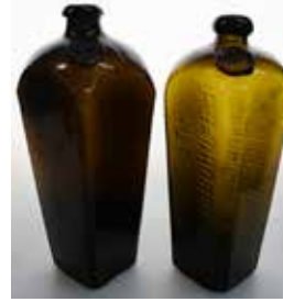
551. VAN HOBOKEN ROTTERDAM GINS 2 large Gins with shoulder seals, left is 288mm tall, dark olive, pig snout, shoulder seal A V H, light scratches, Good 7/10 plus 281mm tall, Olive amber, blob style top, A Van Hoboken Rotterdam to 2 panels, shoulder seal A V H, side edge chip to front, minor marks, Very Good 7.5/10 (2)