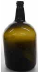
140. EARLY ENGLISH FREE BLOWN WINE BOTTLE 277mm tall dark olive amber glass, wide bodied, good gloss, double collar rim, pontil to base, Very Good 9/10