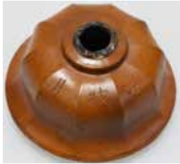
571. CHINESE OPIUM BURNER + 2 OTHERS 35mm tall, 80mm wide, convex base, terracotta coloured Opium Bowl, Chinese characters impressed into the shoulder, Very Good 9/10, plus 50mm tall, small stoneware jar, decoration to shoulder, no marks, Very Good 9/10, plus 40mm x 50mm, unusual object, unusual characters impressed around the 6 sides, has some damage to one end, interesting but what is it for?, Good 7/10 (3)