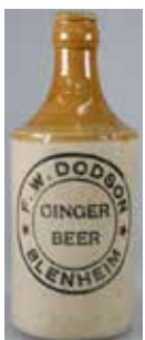
18. DODSON BLENHEIM GINGER BEER GB92, dumpy tan top crown top, F W Dodson Blenheim, Mauri Bros potter, light wear to shoulder, minor marks, Very Good 8.5/10