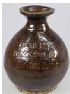
576. WING LEE WAI TIGER WHISKY 160mm tall, brown glazed Chinese Tiger Whisky, embossed to side, 'Federal Law Forbids Sale or Reuse of This Bottle', to base 'Wing Lee Wai Hong Kong' with Chinese writing, heavier than usual, Very Good 9/10