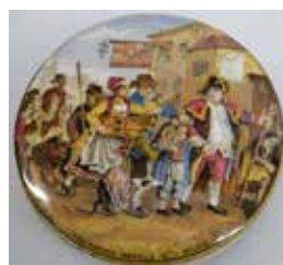
352. PARISH BEADLE PRATT LID Mortimer 322b, 72mm diameter, The Parish Beadle After Wilkie, multicoloured street scene lid, base edge chips and small fracture, light crazing, Very Good 8/10