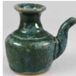
567. CHINESE OIL POT 97mm tall, Chinese Oil bottle, mottled green glazed pot, wax seal to base, Very Good 9/10