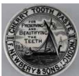
351. NEWBERY & SONS LONDON POT LID 66mm diameter, black and white Pot Lid, Cherry Tooth Paste F Newbery & Sons London, featuring an ancient looking sailing craft with cliffs and a lighthouse in the background, crazing, light discolouring, Very Good 8.5/10