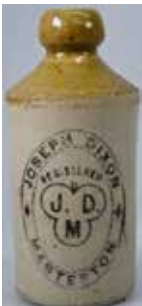
17. DIXON MASTERTON GINGER BEER GB78, blob top dumpy cork stoppered, Joseph Dixon Masterton, unmarked Hutson pottery, small inner rim edge chip, Very Good 8.5/10