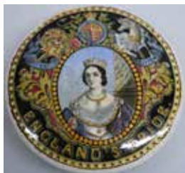
346. ENGLAND'S PRIDE PRATT LID Mortimer 164c, 105mm diameter, England's Pride, multicoloured with image of a young Queen Victoria, crazing, small flange edge chip, Very Good 8/10