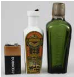
561. HARTWIG KANTOROWICZ, DE KUYPER'S MINIATURES 96mm tall embossed Hartwig Kantorowicz Berlin Hamburg, with original labels to 3 sides, damage to one label, minor rim edge chip, Very Good 8/10 plus 110mm tall miniature, ABM, De Kuyper's, Squareface and heart shaped label to a third panel, lead seal and corked but empty, Very Good 8.5/10 (2)