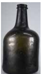
132. EARLY ENGLISH SQUAT FREE BLOWN WINE BOTTLE 197mm tall, dark olive, double collar lip, pontil base, an Early English Wine bottle, a few scratches and light wear, Very Good 7.5/10