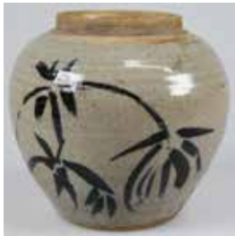
570. CHINESE HIGH GLOSS GINGER JAR 115mm tall, high gloss Chinese Ginger Jar, no lid, bamboo design to body, Shamrock style impressed potters mark, Very Good 8.5/10