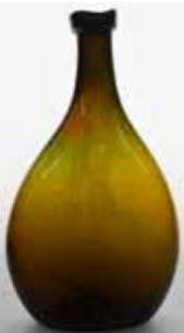
130. PERSIAN SADDLE FLASK 265mm tall, olive honey amber glass, free blown Saddle Flask, large pontil to base, Very Good 9/10