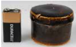
572. CHINESE LIDDED POT 40mm tall x 60mm dia, glazed Chinese lidded pot, Chinese character in relief to base, minor chip to lid flange wall edge, Very Good 8/10