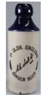
171. SCOTT AUCKLAND GINGER BEER GB295, blue top blob top internal thread, original stopper, A C Scott Ye Olde Englishe Ginger Beer, Pearson potter, inner rim edge repair, scuff to base edge below transfer, minor marks, Good 7/10