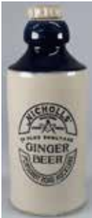
164. NICHOLLS' AUCKLAND GINGER BEER GB 251, blue top blob top, Nicholls' ye Olde Englyshe Ginger Beer Ponsonby Road Auckland, Bourne 8 potter, original white ceramic stopper, minor marks, Very Good 9/10