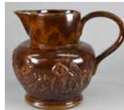
300A. COLONIAL HUNTING JUG 155mm tall, Colonial Jug with a country scene including dogs and horses in relief, in dark tan, unknown early New Zealand pottery, chip repair to the rim edge on the pouring spout, Very Good 8/10