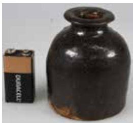
573. CHINESE SOY SAUCE SMALL POT 85mm tall, glazed Soy Sauce pot, Rare small size, Very Good 9/10