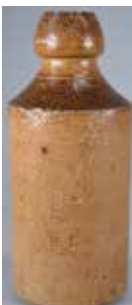
361. COOPER WELLINGTON GINGER BEER GBI-14, GCO012 (Capital Thirst), all over tan, impressed vertically G Cooper Wellington, no potter, rim edge and shoulder wear, small shoulder glaze chips, base edge chip, minor marks, Very Good 7.5/10