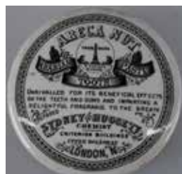
355. SYDNEY HUGGETT LONDON ARECA NUT POT LID 93mm diameter black and white Pot Lid, Areca Nut Arabian Tooth Paste Sydney Huggett Chemist London, Trade Mark featuring Cleopatra's Needle flanked by a sphinx on either side, registration number 55348 (dating the design to 1886), light rim edge wear, inner rim edge chips, small 10mm inner wall crack, crazing, slight discolouring, Very Good 7.5/10