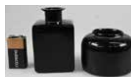
557. BLACK GLASS PERFUME & INK 85mm tall, 53mm square, black glass perfume bottle, with flared ground lip, no stopper, smooth base Very Good 9/10 plus 54mm tall cylindrical inkwell, has indentations on neck for a metal fitting (absent), ground pontil to base, minor marks, Very Good 8.5/10 (2)