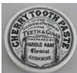
348. HAROLD KANE GIBBORNE NZ POT LID 69mm diameter black & white Lid, Harold Kane Chemist Gisborne Cherry Tooth Paste, light crazing, Very Good 9/10